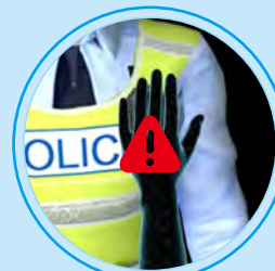
Camera Blocked Alarm