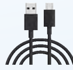
USB Type-C Data Cable