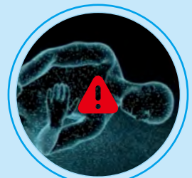
Man Down Alarm